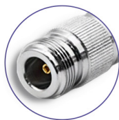
Connector N female