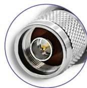
Connector N male